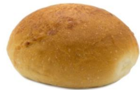
Pane al latte