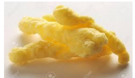
Patatine al formaggio