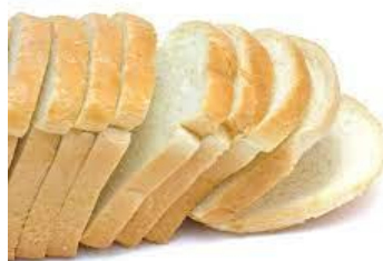
Pane in cassetta